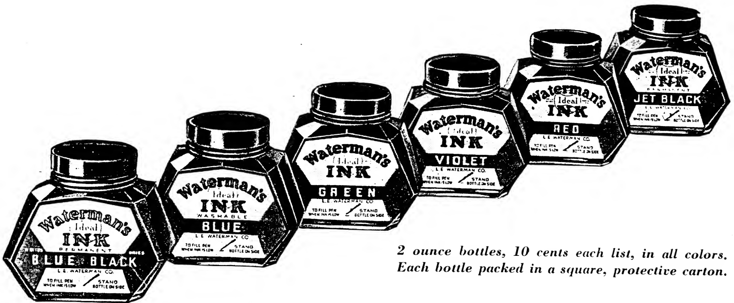
2 ounce bottles, 10 cents each list, in all colors. Each bottle packed in a square, protective carton.

This container may be had with any of the six colors of Waterman's ink listed below by their respective numbers.